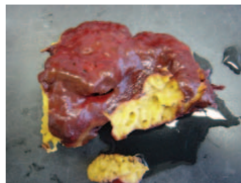
Sponges are rich sources for natural products with interesting activities.

Natural products are not only recognized for their pharmaceutical activity. Non prescription products, such as food additives or plant extracts with beneficial effects on human health are also an important market. More and more research effort is invested