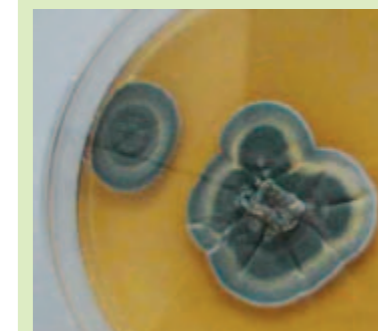
Many filamentous fungi produce important drugs like, e.g. penicillin.